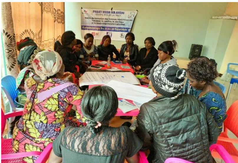
Group discussion during women leaders' training in alternative conflict management and peace negotiation in Lubero and Bwito on conflict analysis, advocacy and transformational leadership.

In the Democratic Republic of Congo, North Kivu, HEKS/EPER, together with the local partner organisation 'Aide et Action pour la Paix (AAP) and Action Solitaire pour la Paix (ASP), implement a human rights-based project focusing on conflict transformation. The situation in Eastern Congo is complex and highly fragile due to the long-lasting conflict about (mineral) resources, land and power that involves armed groups, the army, state authorities, private businesses, and local communities. Since the beginning of 2022, around 5.5 million Congolese have had to flee to other parts of the country for these reasons. According to estimates, a total of 19.6 million people in the DRC needed hu-