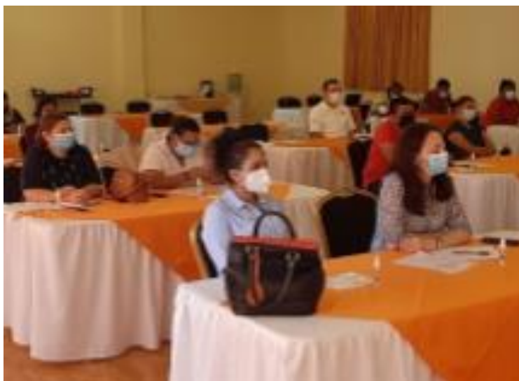
Participants of ProdeHonduras activities in the city of Choluteca.

The ongoing project 'Promotion and Defense of Human Rights in Honduras' (ProdeHonduras), part of the EU-funded ProDerechos, aims to enable and strengthen civic actors and improve the cooperation with and accountability of duty bearers in Honduras. ProdeHonduras is implemented by a consortium of CSOs (COFADEH, C-LIBRE, PWS and PI), with HEKS/EPER taking the lead. Civil society organisations working in human rights promotion and protection are supported to improve their technical capacities and build strategic dialogue with other actors and state authorities. They coordinate networks and platforms and monitor local and national policies and strategies to promote, protect, and respect human rights. One of the project's main objectives is to improve inter-